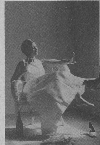
"Diamonds Are A Girl's Best Friend"